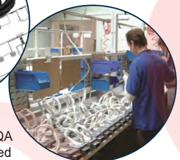
Factory QA controlled